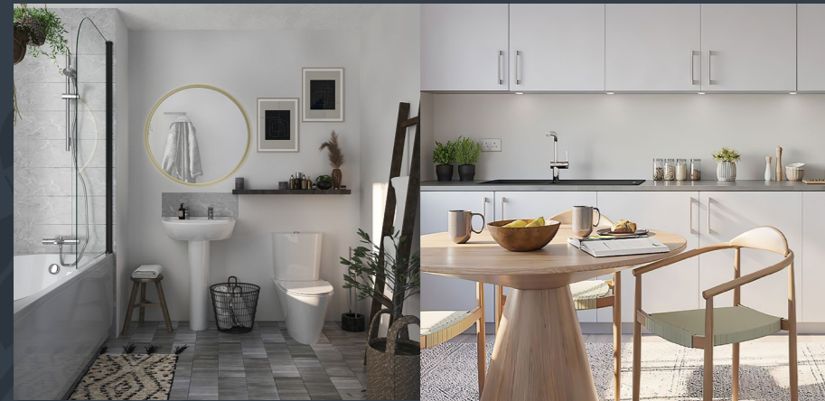
Computer generated images and photos are indicative of how your property may look and are examples only. Layouts and finishings may vary.

Outside, each property benefits from a private garden, so whether you're bringing family and friends together or prefer some peace and quiet, there's an outdoor space to enjoy. Parking spaces are also provided for each home.