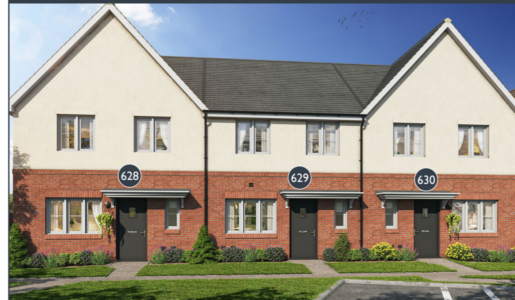
PLOTS 628, 629 & 630 NEW MONKS PARK THREE BEDROOM TERRACED HOUSES