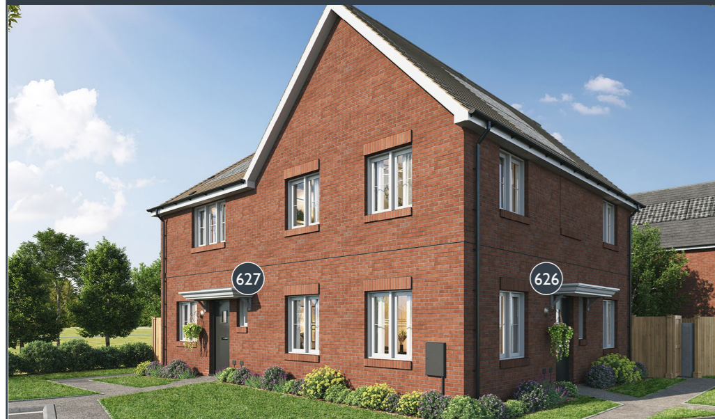
PLOTS 626 & 627 NEW MONKS PARK TWO & THREE BEDROOM SEMI-DETACHED HOUSES