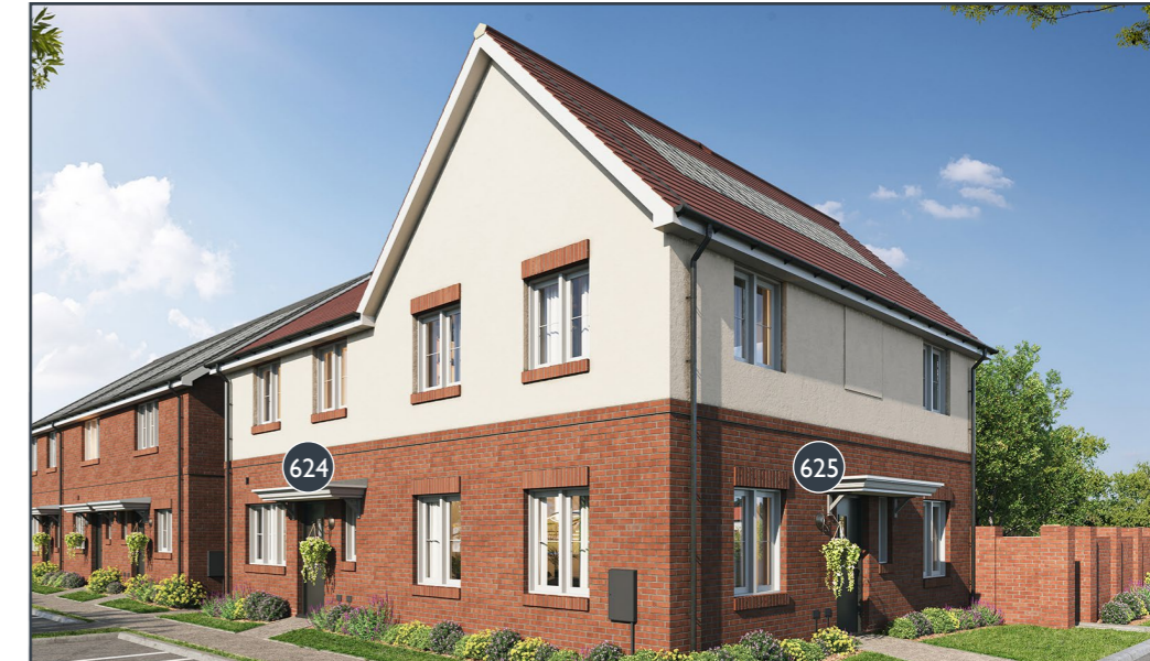
PLOTS 624 & 625 NEW MONKS PARK THREE BEDROOM SEMI-DETACHED HOUSES