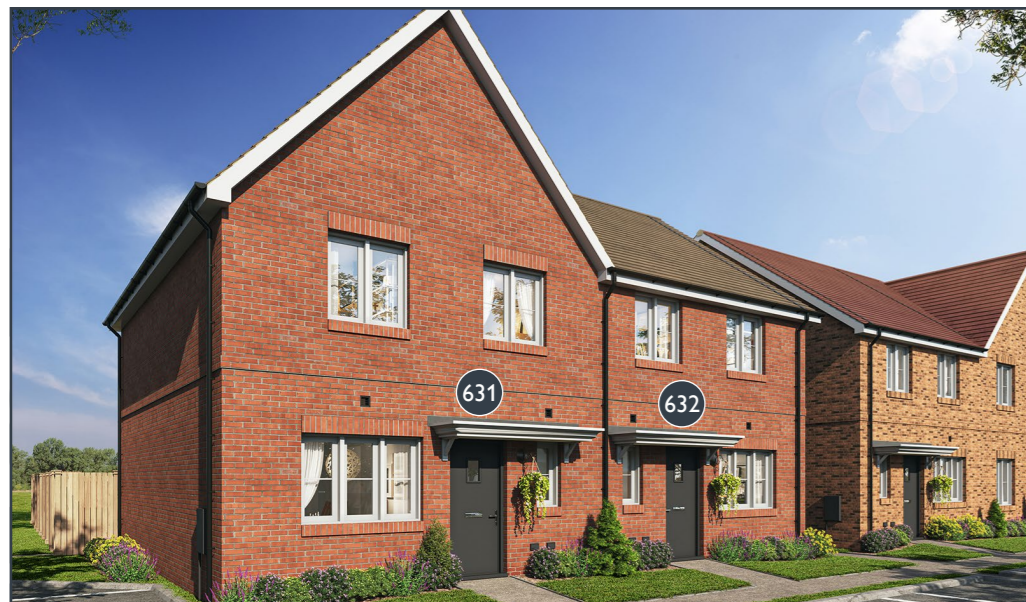
PLOTS 631 & 632 NEW MONKS PARK THREE BEDROOM SEMI-DETACHED HOUSES