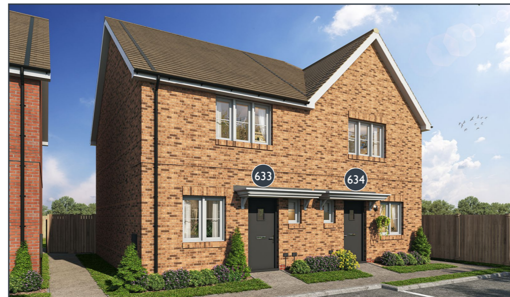
PLOTS 633 & 634 NEW MONKS PARK TWO BEDROOM SEMI-DETACHED HOUSES