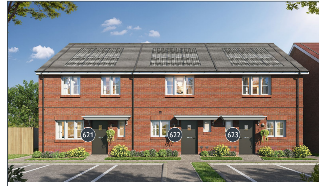
PLOTS 621, 622 & 623 NEW MONKS PARK TWO & THREE BEDROOM TERRACED HOUSES