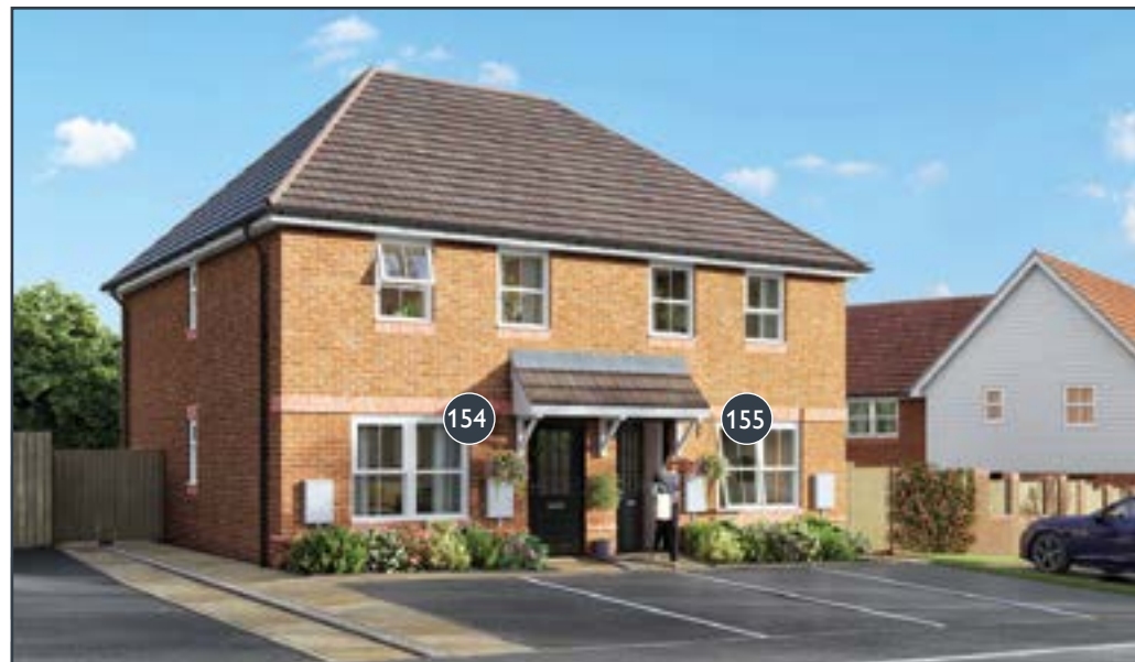
PLOTS 154 & 155 ECCLESDEN PARK TWO BEDROOM HOUSES