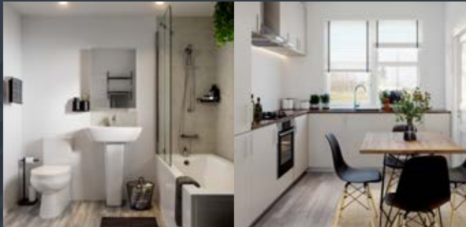
Computer generated images and photos are indicative of how your property may look and are examples only. Layouts and finishings may vary.

Outside, our two, three and four bedroom houses benefit from private gardens. So, whether you're bringing family and friends together or prefer some peace and quiet, there's an outdoor space to enjoy. Parking spaces are also provided for each home.