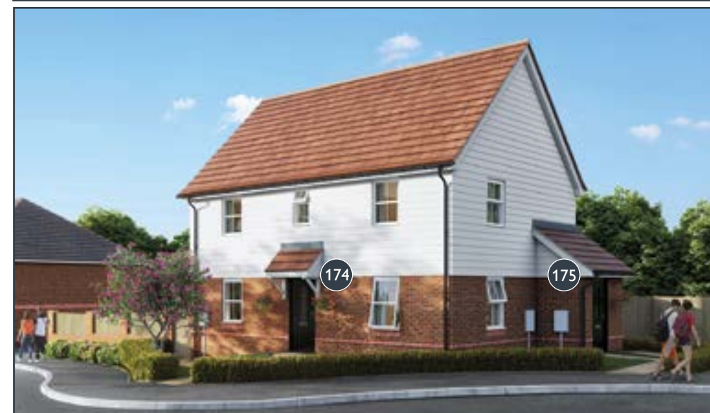
PLOTS 174 & 175 ECCLESDEN PARK ONE BEDROOM MAISONNETTES